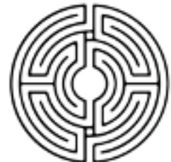
7-Circuit Mirror Path

Choose a Double Spiral Design that allows people to walk from one section to the other when open. These can be adapted walked as processional by stepping from the center straight out of the design.