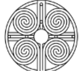
11-Circuit Spiral Chartres

If you have a large space, create 6' wide pathways that allow people to maintain distance at all times. At six feet a 3-Circuit labyrinth would require at least 42' and a 5-Circuit would require 66'! Perhaps a good compromise is 3' pathways with a larger center which would result in these measurements: