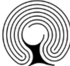
5-Circuit Baltic Wheel