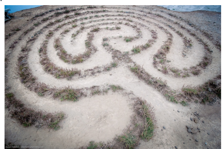
Healing Labyrinth in Half Moon Bay after removal of the stones on the Spring Equinox (weight lifted)